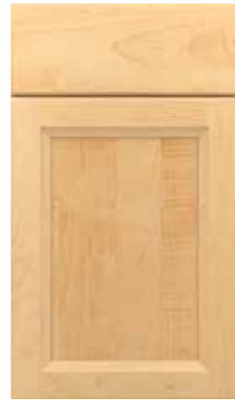
BEXLEY F M M P H