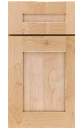
DARWYN 5-PIECE F M M P O H R