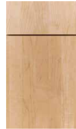
CHALET F M M P