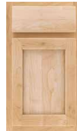
KENOSHA T M P H O