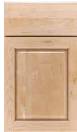
WELZIN F M M P O H