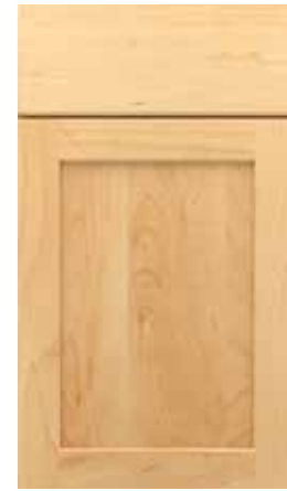
SEDONA F M M P O H R