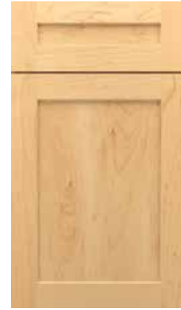
SEDONA 5-PIECE F M M P O H R