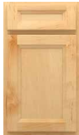
LAUTNER 5-PIECE T M P H