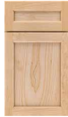
KENDRICK 5-PIECE F M M P H O