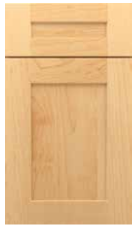
DOVER 5-PIECE F M M P O H R