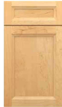
BEXLEY 5-PIECE F M M P H