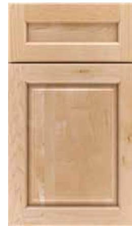
WELZIN 5 PIECE F M M P O H