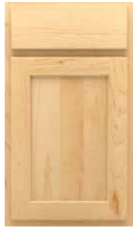
ARBOR T M P O H R