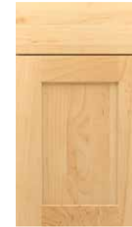
DOVER F M M P O H R