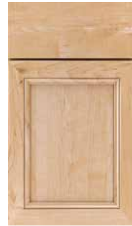
BISHOP F M M P O