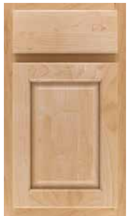
FYFER T M P O H