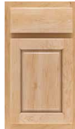
WEXFORD T M P O H R