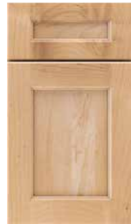
WALDRON 5-PIECE F M M P O H