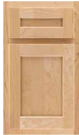
ARBOR 5-Piece T M P O H R