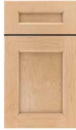
ROSEDALE 5-PIECE F M M P