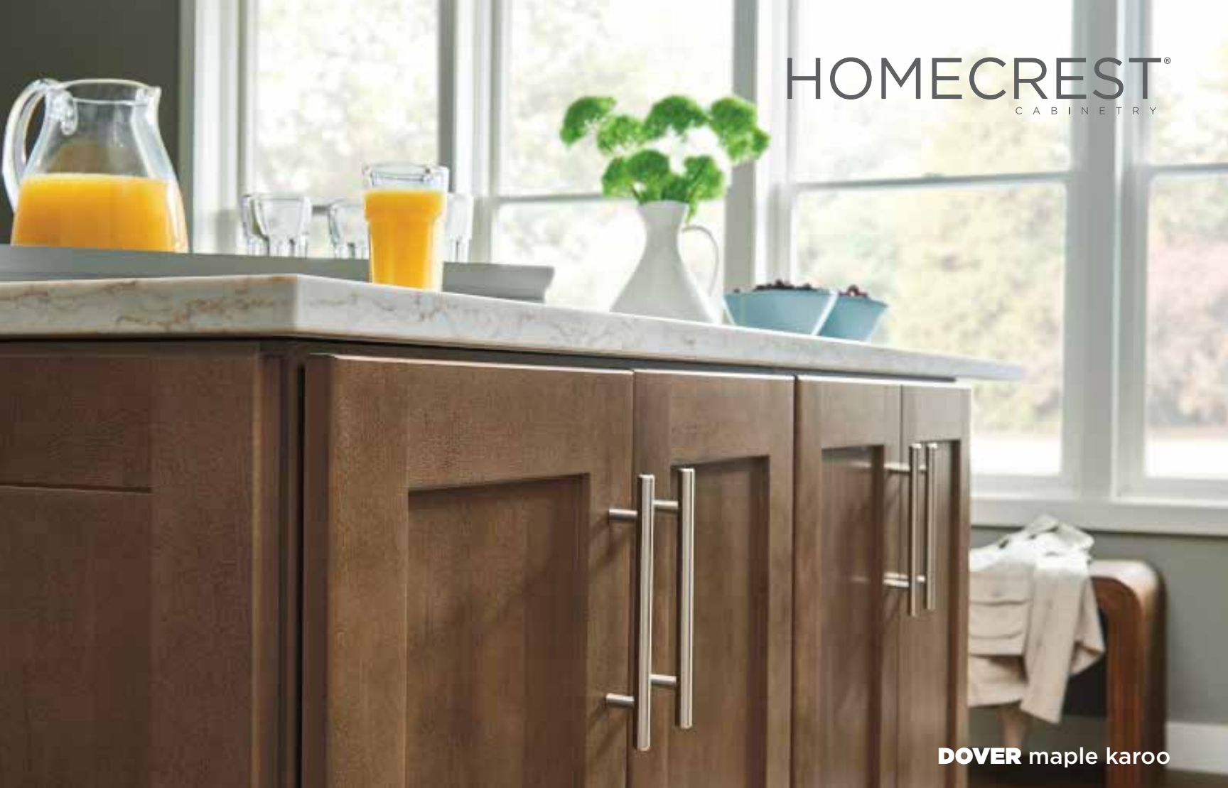
DOVER maple karoo