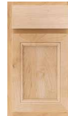
JOPLIN T M P O