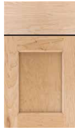
ROSEDALE F M M P