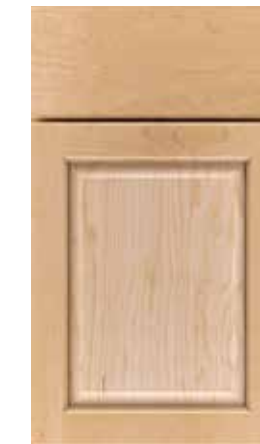
PIPER F M M P O H