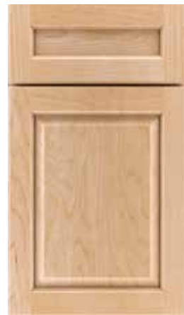
PIPER 5-PIECE F M M P O H